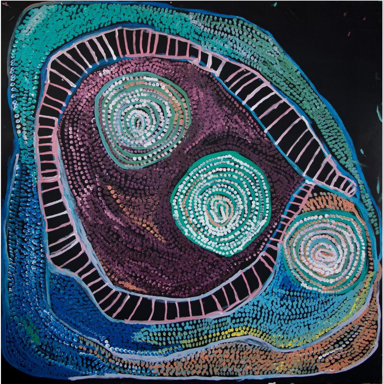
Nyarapyi Giles, Warmurrungu 2016, Tjukurla WA