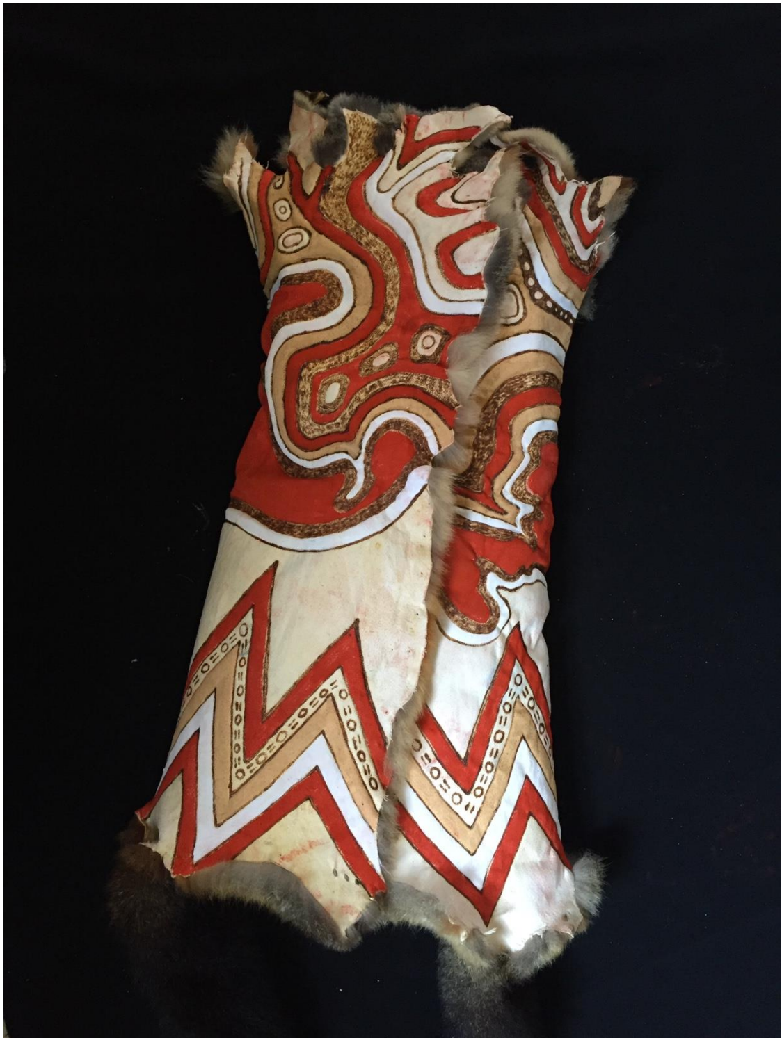
Maree Clarke, Babies Possum Skin Cloak 2016