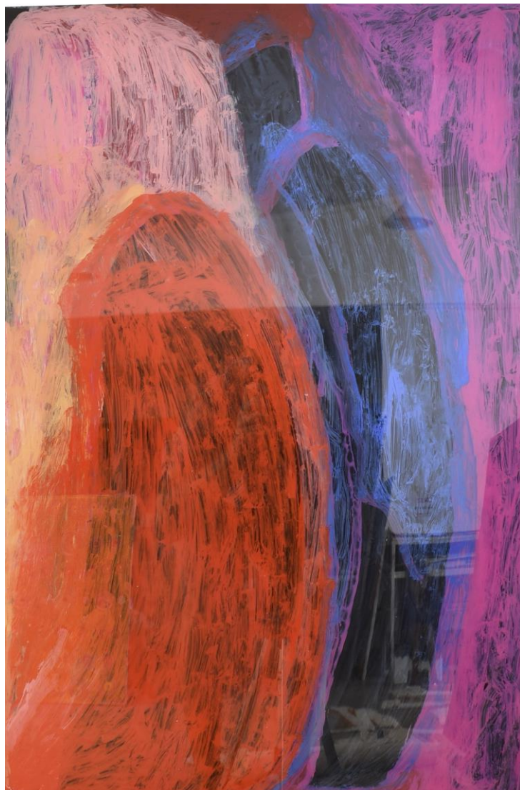
Nada Tjigila Rawlins , Kiriwirri Waterhole Synthetic polymer paint on Perspex 2016, Mangkaja Arts, Fitzroy Crossing, WA