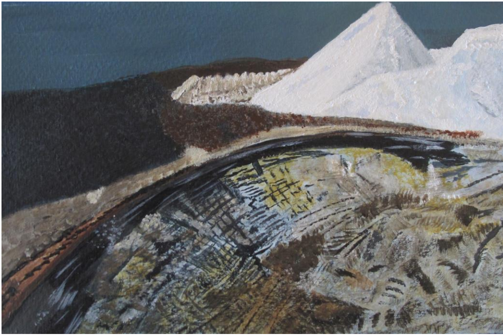
Winnie Sampi, Port Hedland Salt, 2016 watercolour on paper